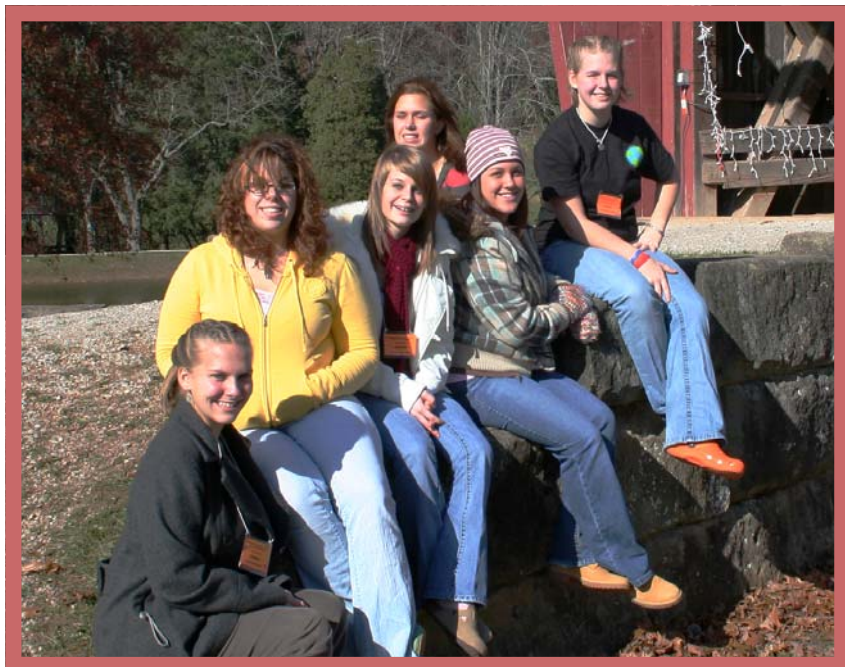
Fall Workshop 2007 Newspaper Staff takes a break from work to pose for a picture during the morning work time.