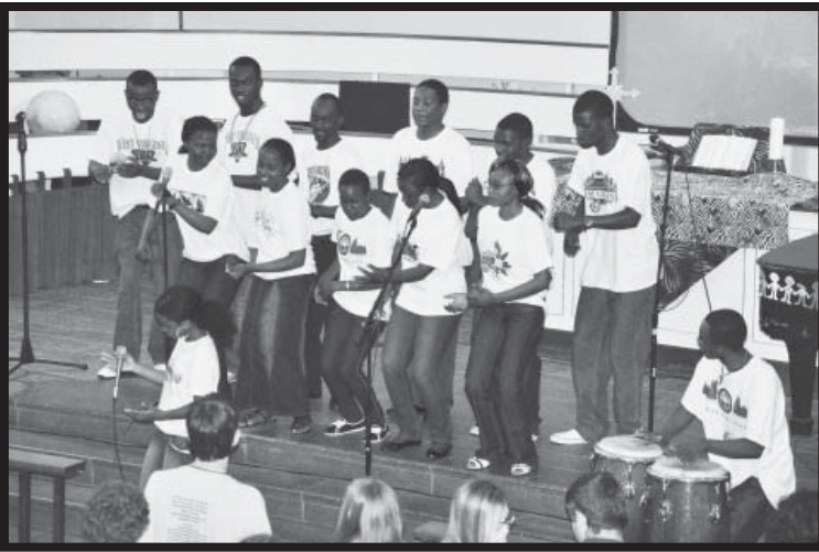
The African University Chour ends their West Virginia tour with a performance at SYC.