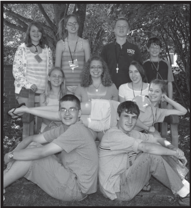
SYC newspaper staff takes time for a photo on Wednesday.

Youth enjoy movie on Tuesday evening with Wesley Chapel in the background.