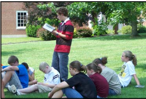
Reading the Bible is an important part of covenant groups