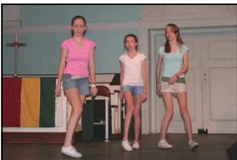
Cloggers connect with taps.