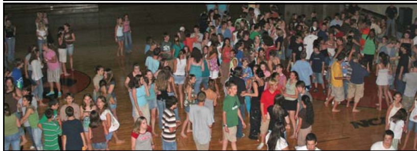
Youth dance the night away on Wednesday evening.

The main goal is to stay connected to God throughout our trials and tribulations and He will bring you through it all.