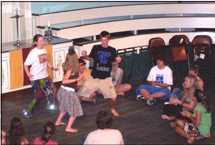
Youth from the rhythms of faith workshop help with the African drum concert. They were the, “honorary drum ensemble,” who preformed various dances and demonstrated various drumming techniques.

Overall, many reports indicate that the concert was, entertaining, informative, and interactive. Although at times the