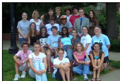
2005-2006 CCYM takes time for a photo before SYC starts.

CCYM is an extraordinary ministry to the youth of this Conference. For those wishing to pursue a career in ministry or simply wanting to take an active role in their faith, consider this as an option. For more information on CCYM and the West Virginia Annual Conference youth, check out http://www.wvumyouth.org .