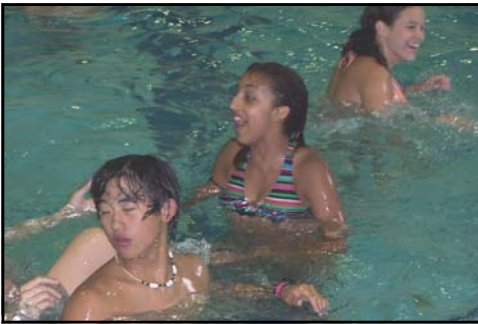
Youth take time to relax in the pool.