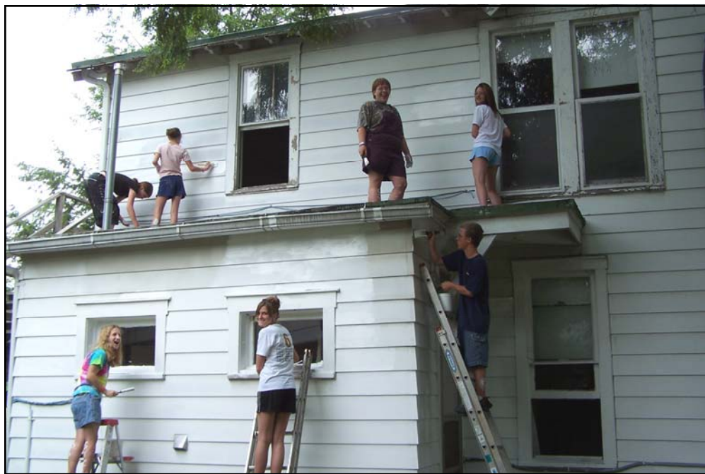
Work team paint house for Upshur Parish.