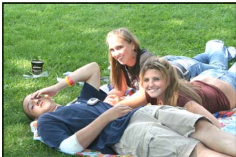
Youth connect during free time.

In this past year we have given $3000 to Project Chacocente, $1500 to the New Life Camp facilitated by Spring Heights, $200 apiece for five people going on mission of peace. We also gave money to Volunteers in Mission and Summer Youth Celebration work teams.