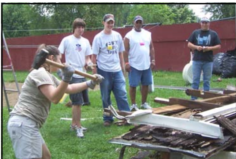
Work team removing porch to do repairs on the house.