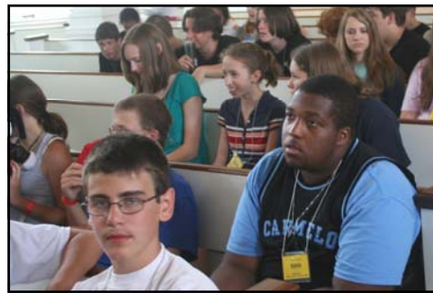
Connecting in the Wesley Chapel.

Ken: Definitely anything you do like this always strengthens your faith.