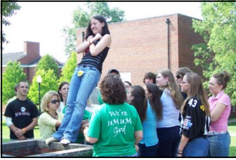
Covenant group works on build trust on Thursday morning during their meeting. This youth is shown falling into the arm of trusted friends.