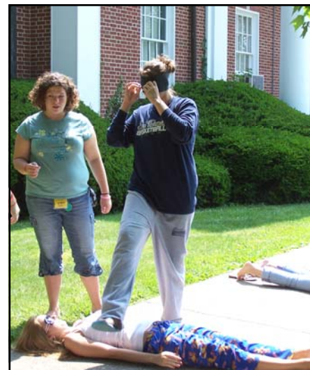
Connecting sometimes requires trust.