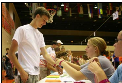
You have to have this to eat.

Many campers agree that covenant groups are an important factor of SYC. Making new friends and learning about God are the highlights of the week.