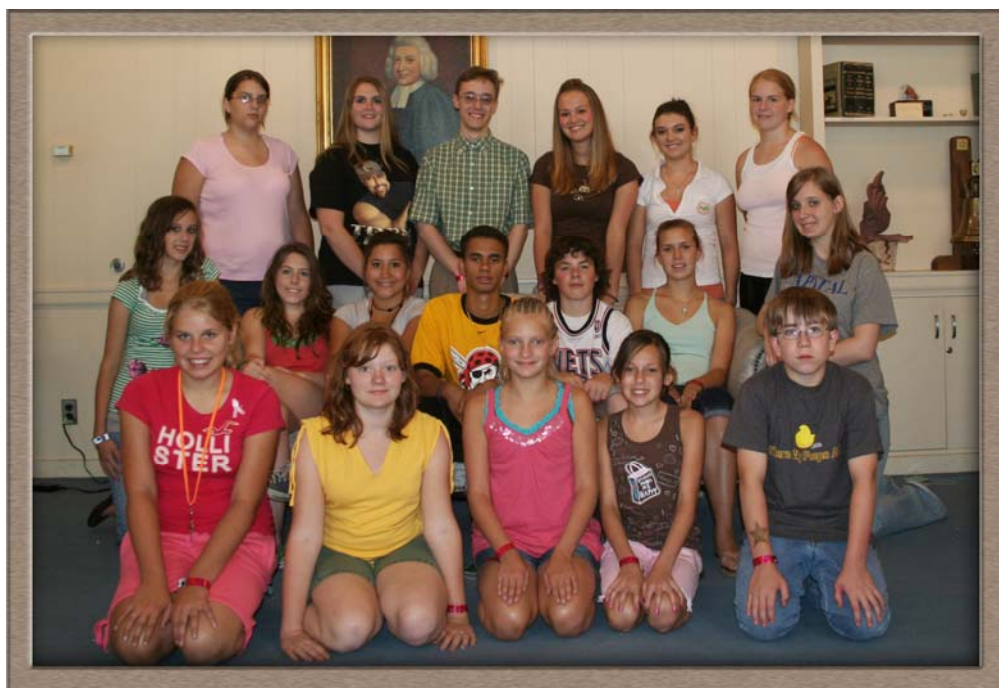
2007 SYC Newspaper Staff